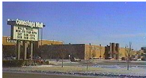
Grand Island (Conestoga Mall)