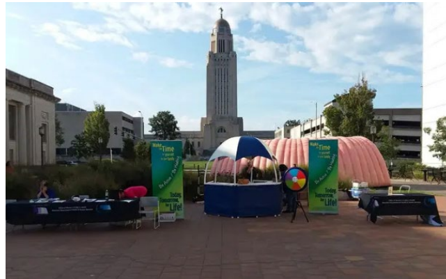
Centennial Mall (Lincoln)