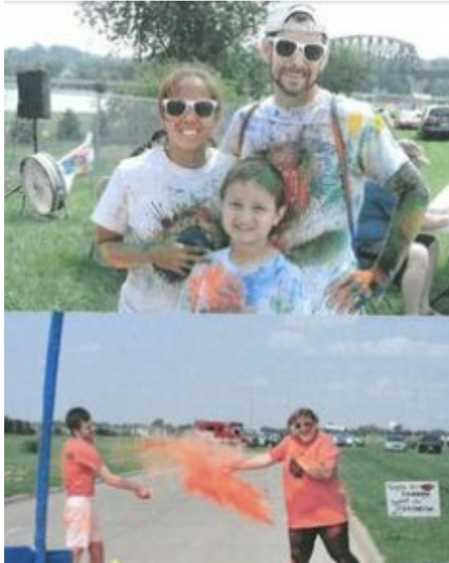
South Sioux City - Colorpalooza