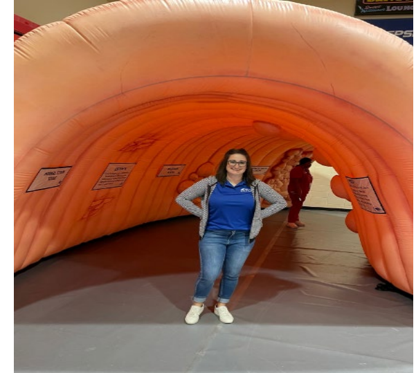
Wisner- Patch Health Fair

Having the inflatable colon at the 2022 PATCH Health Fair helped to inform the community about the importance of getting screened for colon cancer.