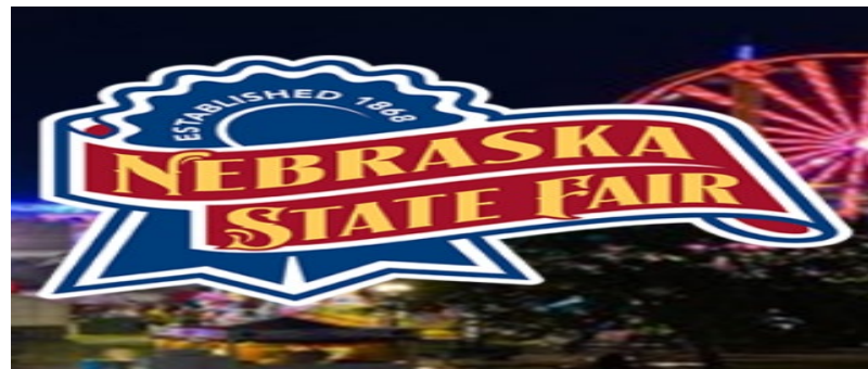
State Fair at Grand Island