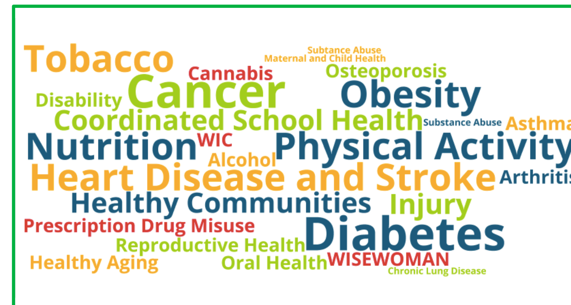
Program areas contained within state chronic disease units, 2016 Survey of States